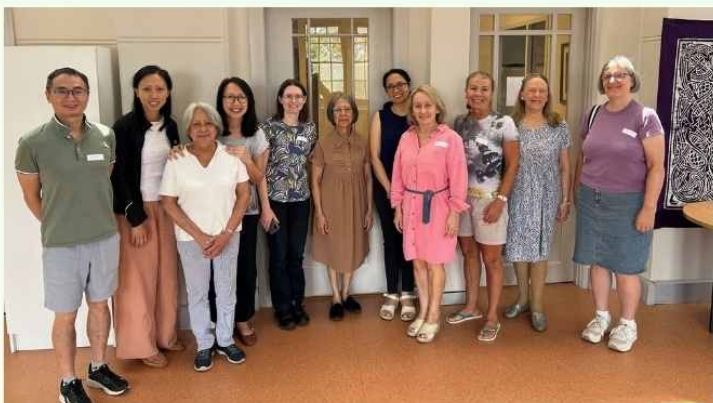
Pictured here are some of our State School Catechists following their recent meeting. On 2nd March we'll observe Catechist Sunday. Please consider if you can join this important ministry of sharing our faith.

you can set up a regular contribution from your own bank account. The details of our 1st and 2nd collection accounts can be found on our parish website ( www.lindfieldkillara.org.au ) under 'Our Parish' → 'Parish Finances'